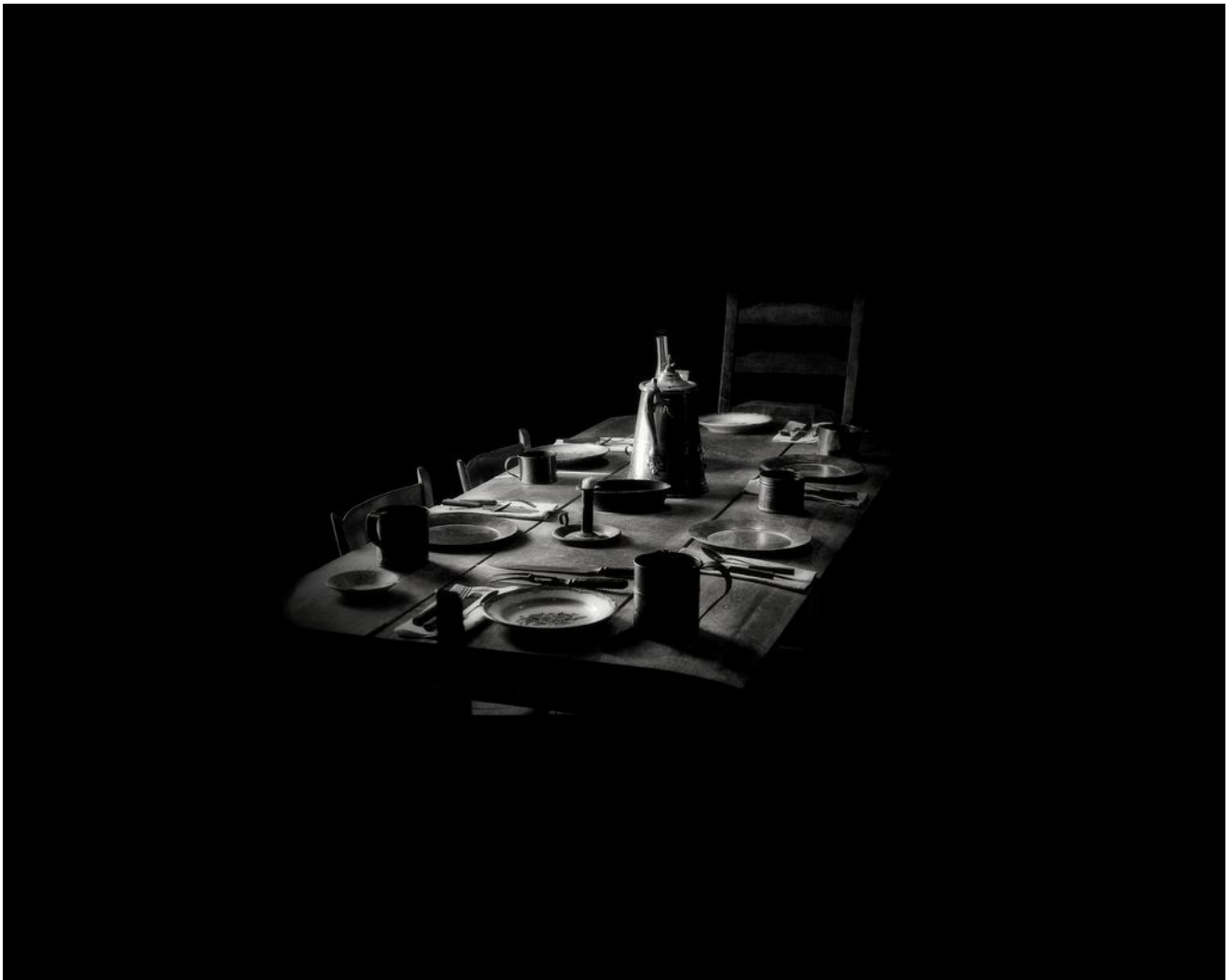
"The Table" by Dave Gilmore, Image of the Year, 2008